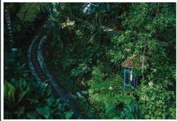
Penang Tropical Spice Garden

Penang's Tropical Spice Garden is a nature conservation complex that features three major garden trails.