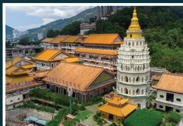
Kek Lok Si Temple

Gurney Food Court is one of the largest upscale food courts in Malaysia and offers the best of Penang on a plate.