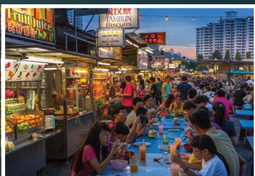
Gurney Food Court

Located 20 minutes by car from our hotel, Penang Hill is a hill resort comprising a group of peaks, hiking trails and botanical gardens.