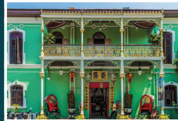
Pinang Peranakan Mansion

Entopia is one of the largest butterfly gardens in Malaysia, with more than 15000 free flying butterflies.