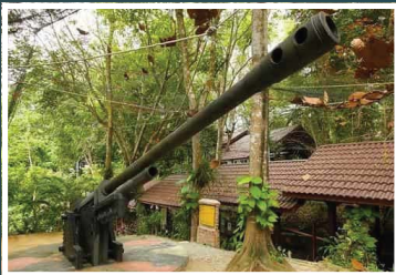
Penang War Museum

Located in George Town, the Pinang Peranakan Mansion is a museum dedicated to Penang's Peranakan heritage.