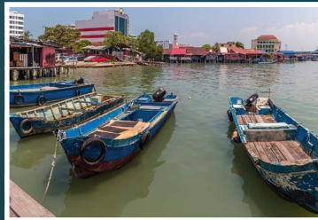
Weld Quay Clan Jetties

Penang War Museum is reputed to be the largest war museum in South East Asia.